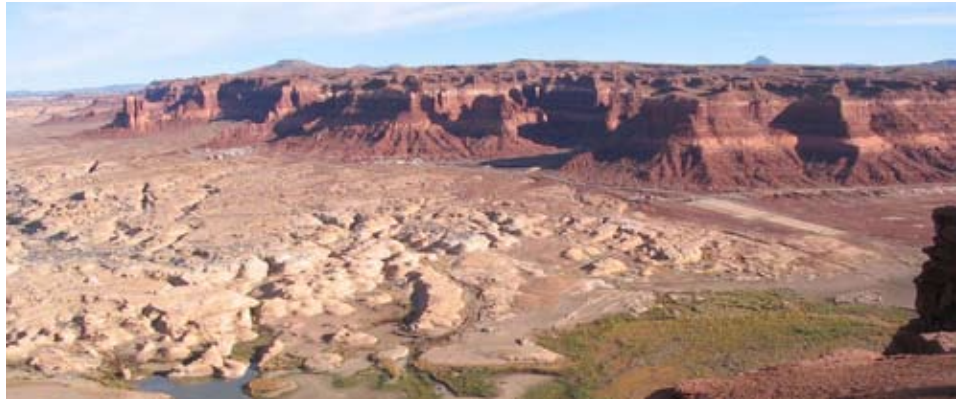
Figure 1. Lake Powell with low water levels in November 2004.