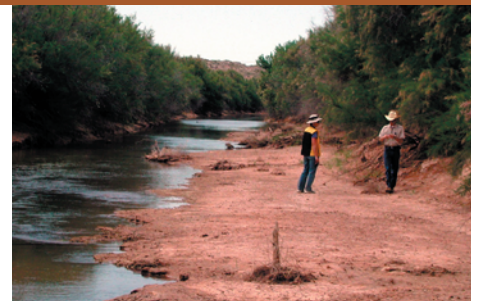
U.S. Bureau of Reclamation scientists work on methods for revegetation that can be used once they eradicate the salt cedar lining the banks of Pecos River near Carlsbad, New Mexico. Although most salt cedar eradication efforts in New Mexico involve using chemical control, the area above is about five miles from a Pecos River site where scientists are trying biological control by introducing a beetle that kills salt cedar.

“The difference is the footprint on the terrain that salt cedar is capable of occu-